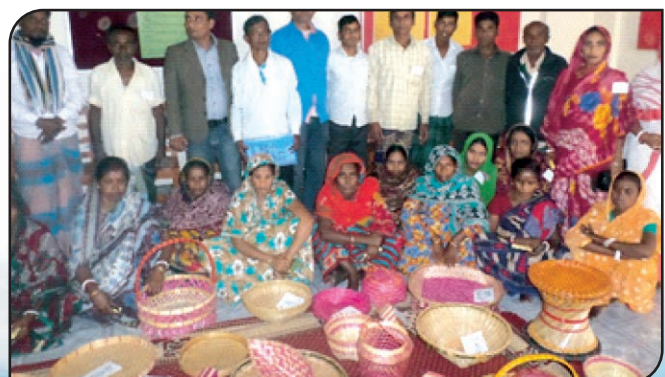
Glimpses of various training sessions on Jute and Bamboo Products