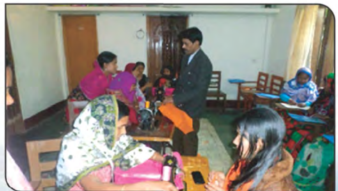
Glimpses of various training sessions on Cane, Jute, Bamboo and Wood Products