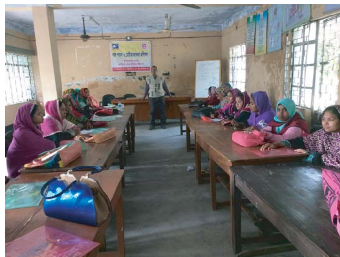
△ A view of the participants in the Skill development training of tailoring

"Women in Peace and Harmony Project" of BRAC aims to strengthen the capacity of women in Bangladesh to stand out and engage themselves in economy through providing them necessary skill development trainings and lessons. The project is financed by UN Women. Under a contract with BRAC, MIDAS conducted 22 batches of skill development training for the women beneficiaries of the project in Jessore, Satkhira, Moulvibazar and Cox's Bazar districts. Total of 12 batches of Tailoring and 10 batches of Beef fattening training were conducted by MIDAS in the four districts where total of 134 and 114 women attended respectively. These courses covered the basic concepts and applying mechanism of tailoring and beef fattening in real life businesses, ensuring increase of self-confidence and knowledge among the women with a sense of entrepreneurship. MIDAS Officials and Skill Trainers conducted these courses.