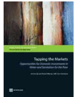
Discounted Price with Vat US $ 13.49