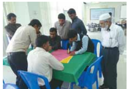
Δ Hands-on training of Resource Teachers (RTs)