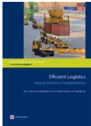
Discounted Price with Vat US $ 13.49