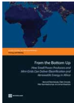
Discounted Price with Vat US $ 18.17