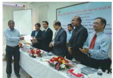
Δ Certificate giving ceremony of second training session