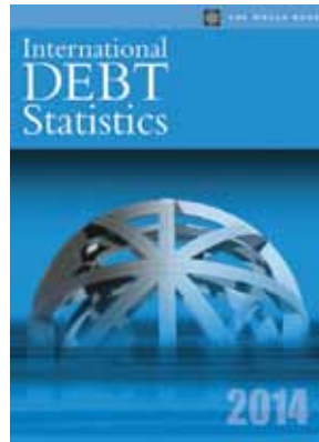
Discounted Price with Vat US $ 39.00