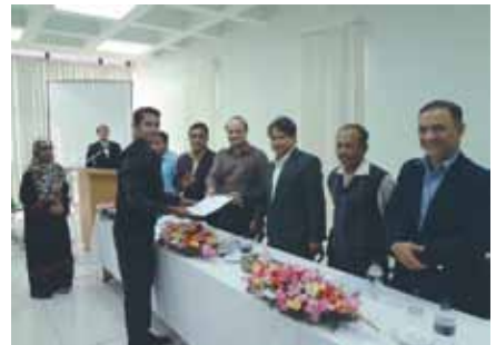
Δ Certificate giving ceremony of first training session