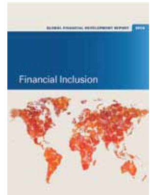
Discounted Price with Vat US $ 18.20