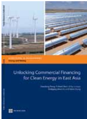
Discounted Price with Vat US $ 18.17