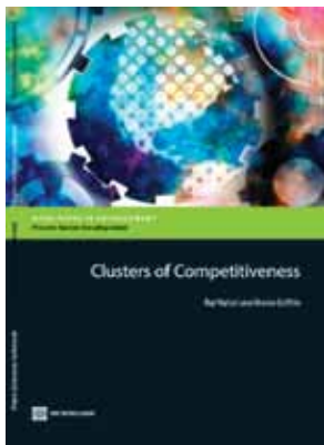
Discounted Price with Vat US $ 13.49