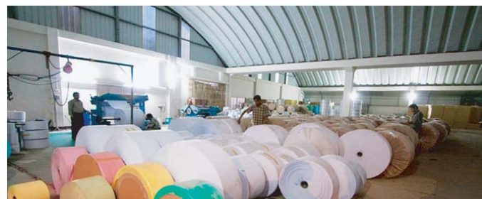
Bangladesh Monospool Paper Manufacturing Limited factory in Dhamrai Upazila