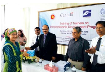
MIDAS is presenting certificate of attendance to a participant